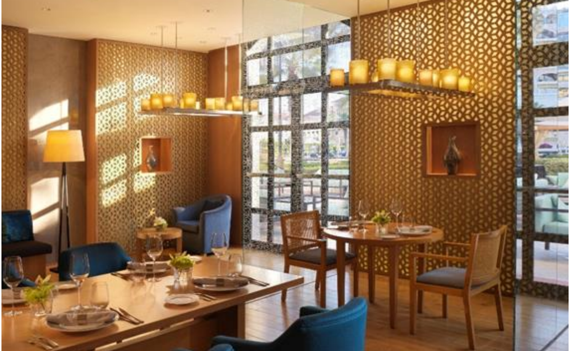
MIJANA – MIDDLE EASTERN