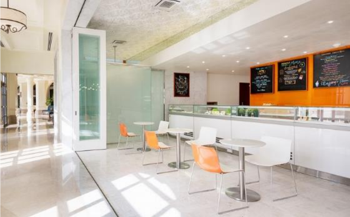
DOLCE – CLUB HOUSE