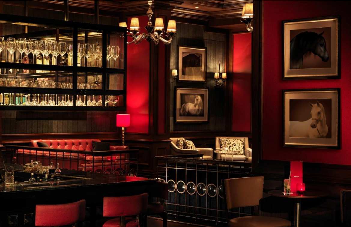
SORSO – PREMIUM BAR