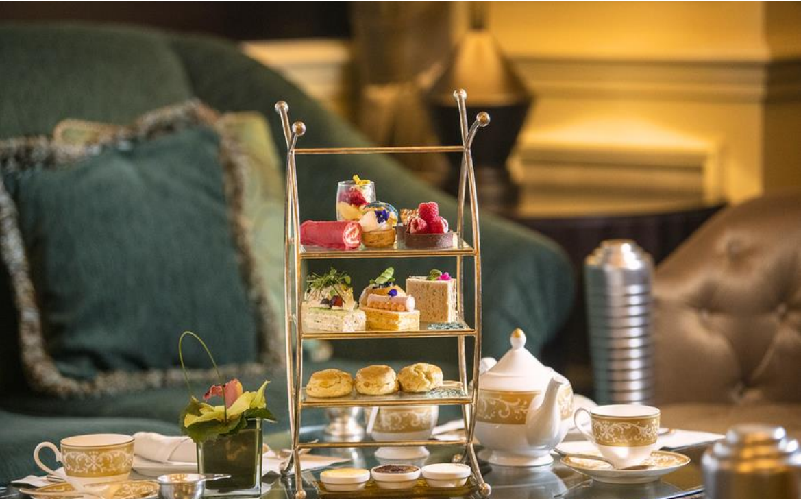
ALBA – LOBBY LOUNGE