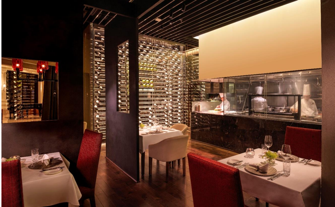
THE FORGE – STEAKHOUSE