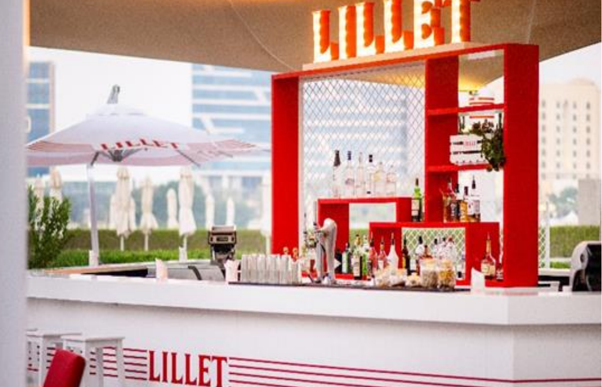
AL FRESCO – LILLET POOL BAR