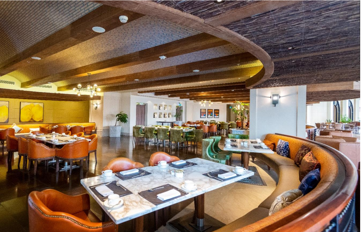
GIORNOTTE – BREAKFAST & ALL DAY DINNING